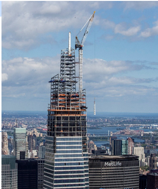
There will be also be a direct access

including refurbishing the Grand Central subway mezzanine level providing more access to the street level. Most of the transit funds will be used to make improvements on the NYC Transit 4 5 6 lines.