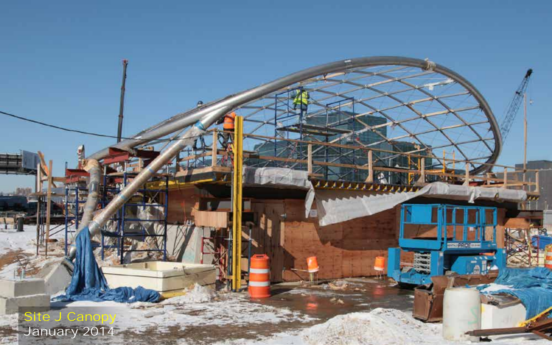
Site J Canopy January 2014