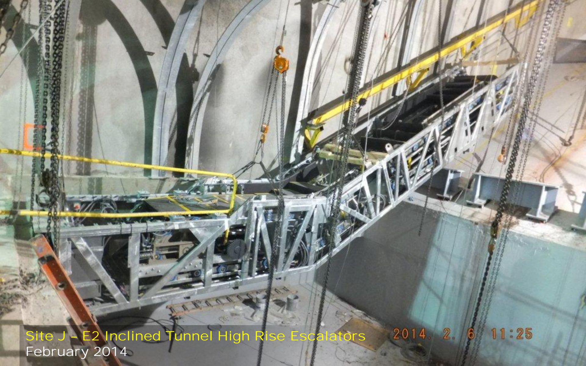
Site J - E2 Inclined Tunnel High Rise Escalators February 2014