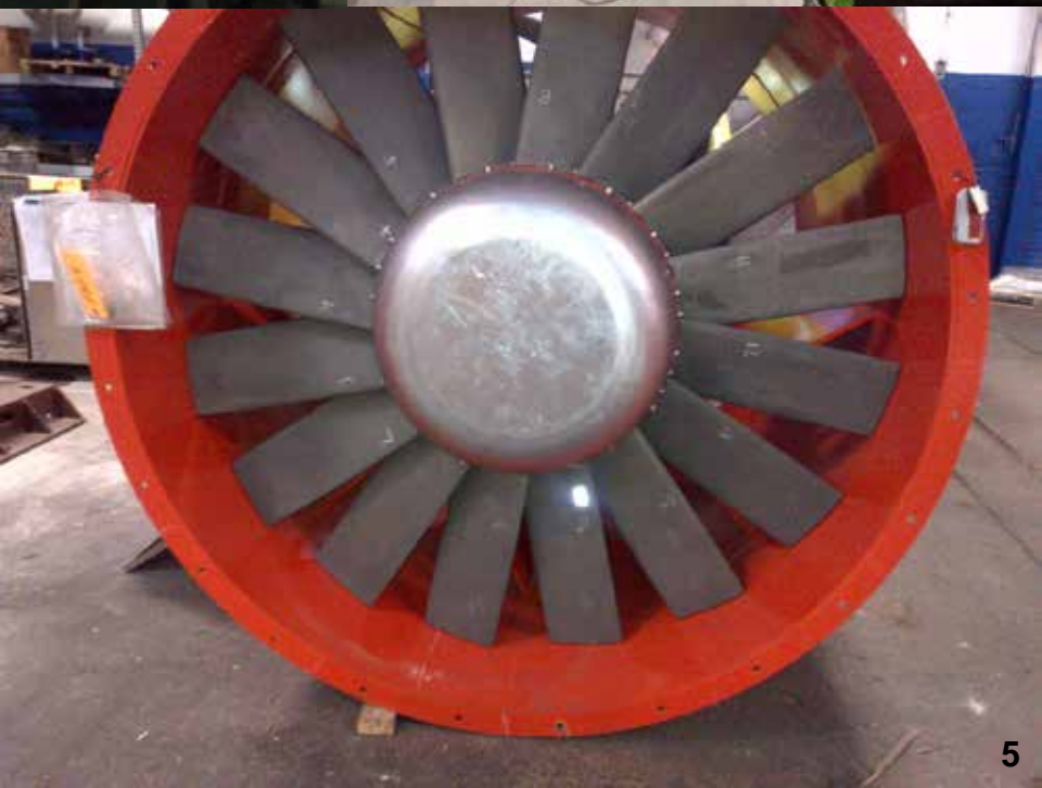
Site L - Fan Factory Acceptance Test