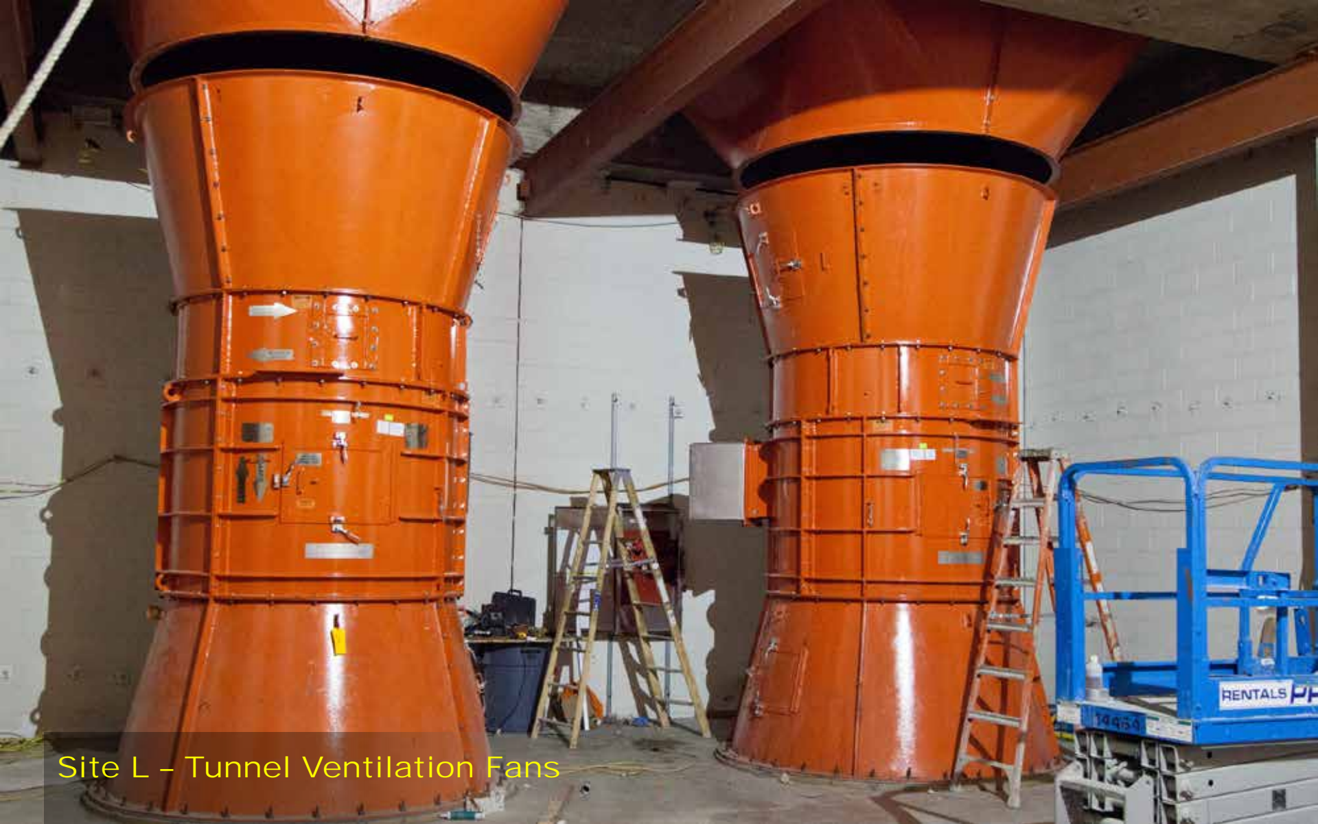
Site L – Tunnel Ventilation Fans