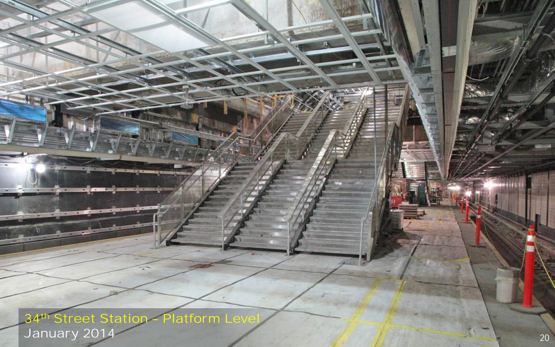
34 th Street Station – Platform Level January 2014