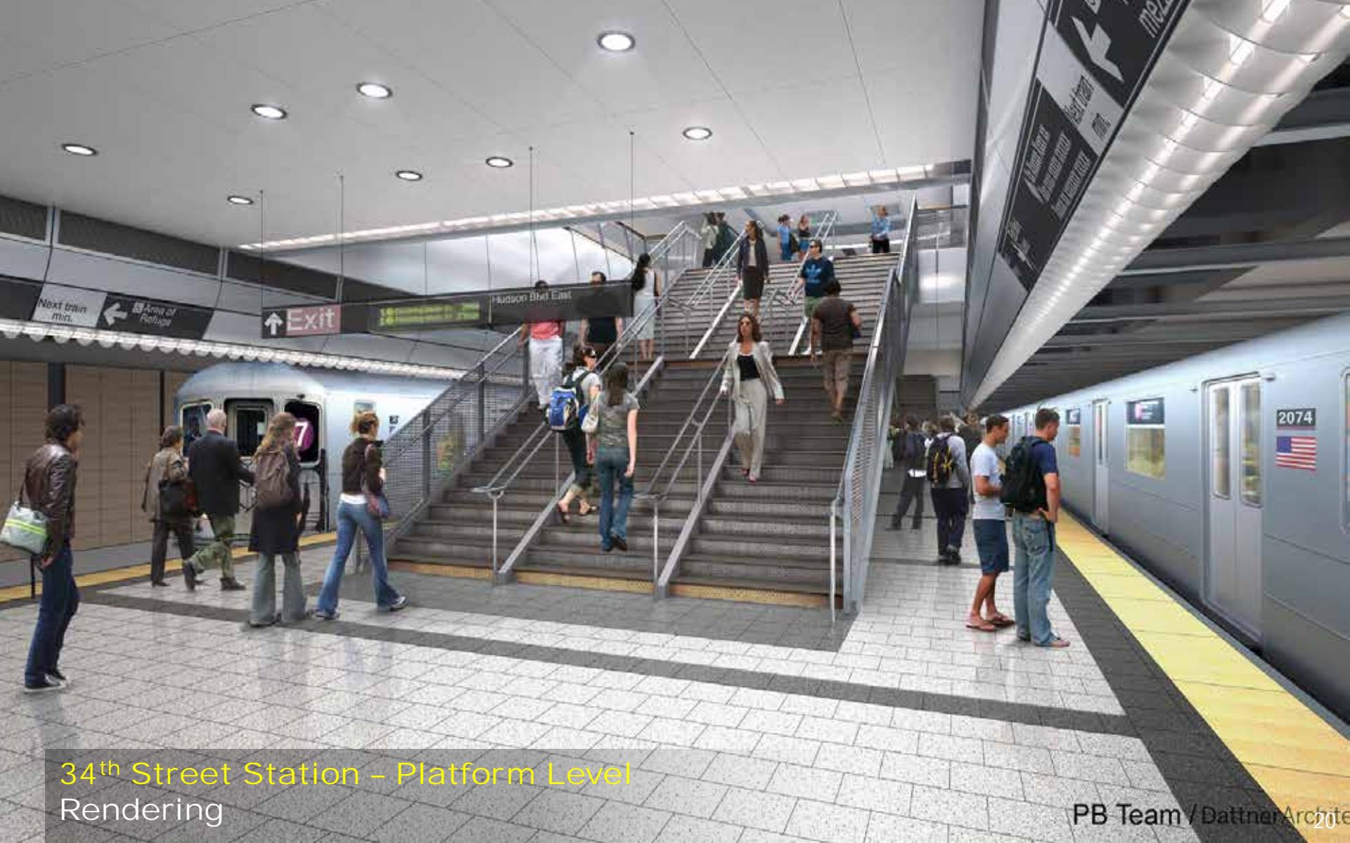
34 th Street Station – Platform Level Rendering