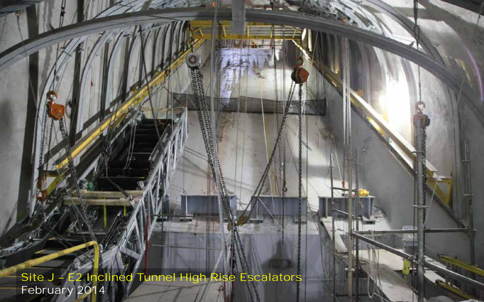
Site J - E2 Inclined Tunnel High Rise Escalators February 2014