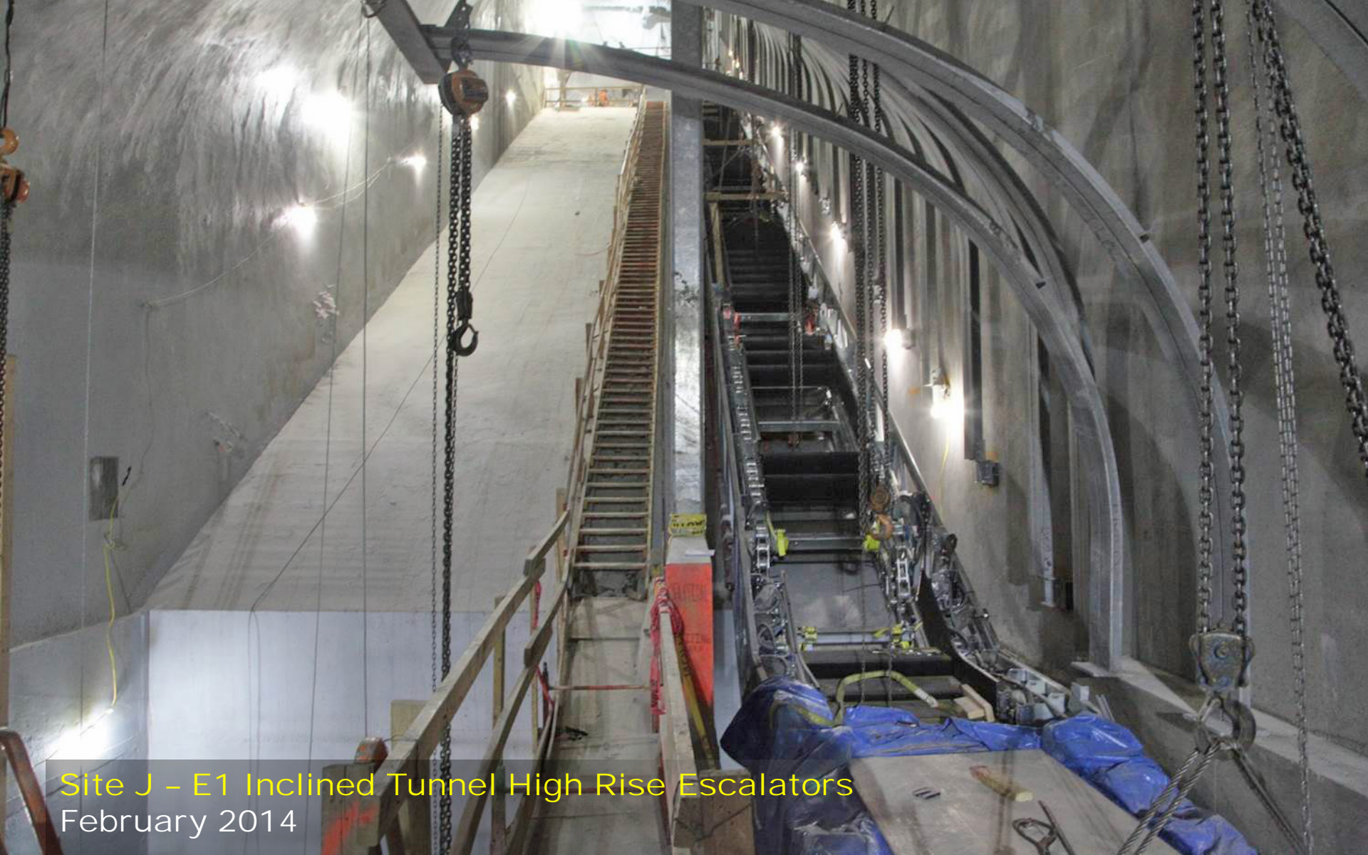
Site J - E1 Inclined Tunnel High Rise Escalators February 2014