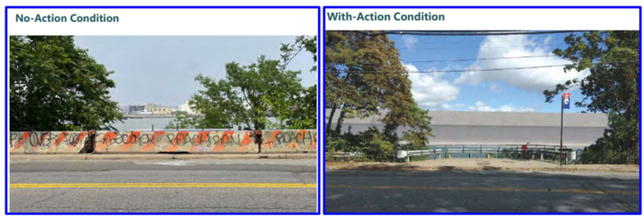
Figure 7: Snug Harbor view of the waterway at page 9-38 of the DEIS.

Better Maps and More Complete Renderings would make the BRT Project and the impact analysis more transparent and more user friendly. The materials published online are massive. There is no set of detailed maps in an easily found, accessible location in the documents. Many of the renderings are incomplete and somewhat difficult to interpret. The "Proposed Alignment through Atlantic Salt" at Figure 2-8 is only part of the story affecting Atlantic, and it makes potential impacts difficult to evaluate fully.