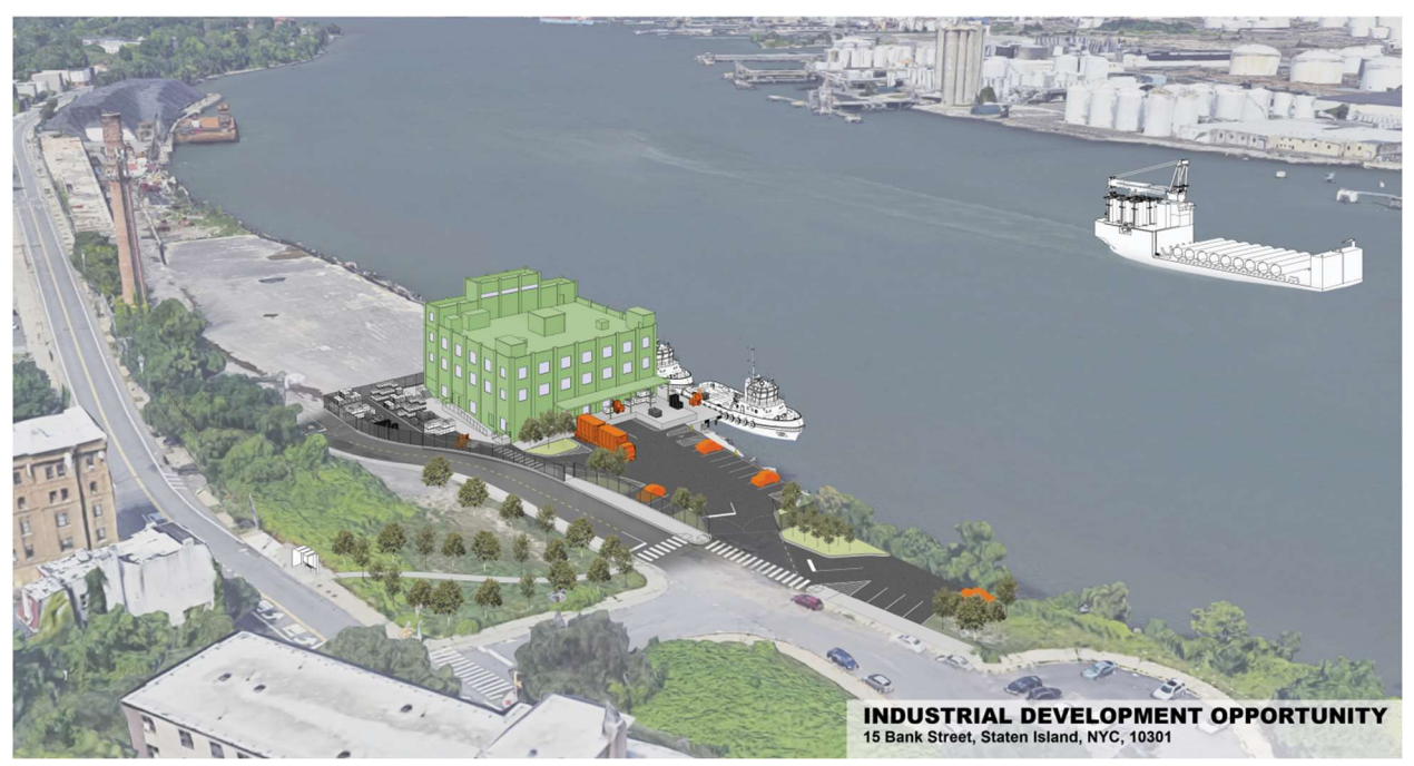
Figure 6: Conceptual docking facility of Offshore Wind support vessels at Atlantic's 15 Bank Street subsidiary.

An important maritime activity for the North Shore of Staten Island will be the development and enhancement of maritime terminals with the capacity to support aspects of the offshore wind industry. Atlantic has directed some of its investments toward that goal. The DEIS, by shrinking Atlantic's cargo handling and storage space while ignoring the reasonable alternative of deploying the city's 100-foot-wide right of way on Richmond Terrace for BRT use, raises the specter of interfering with maritime goals.