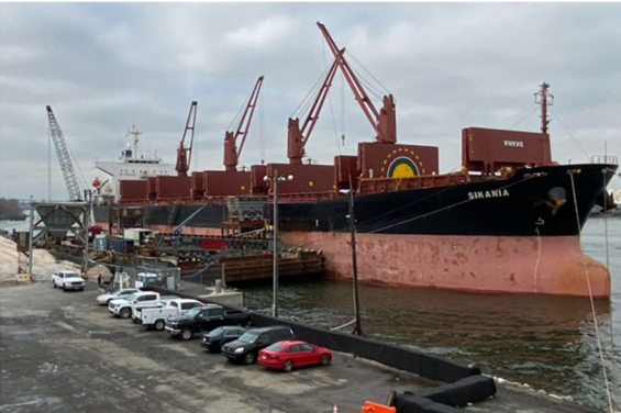
Figure 1: The view on the left is looking west to the cargo laydown area adjacent to the ship berth. The storage capacity of the west end will be severely reduced by the DEIS design. The photo on the right shows a 625-foot-long cargo vessel in the berth.

The need for substantial salt storage space on Atlantic's wharf is driven by (a) the "just in time" delivery demands of public-safety agencies, (b) the unpredictable nature of winter weather, and (c) the lack of salt storage space that public safety agencies themselves possess. The NYC Department of Sanitation, the NYS highway districts, and other state and local public safety agencies lack sufficient storage space to have a season's worth of road salt stockpiled in their own sheds and depots. This is especially true in the five boroughs, and it is also true on Long Island and in areas north of NYC. All these agencies need to be resupplied during the average winter, and when they order more salt, they want it delivered quickly. Accordingly, the public safety agencies require Atlantic and other companies to resupply them on very short notice—often only 48 hours, or 72 hours—if public safety supplies are running low or if a major snow and ice event is forecasted. Storms in the forecast can cause dramatic demand spikes.