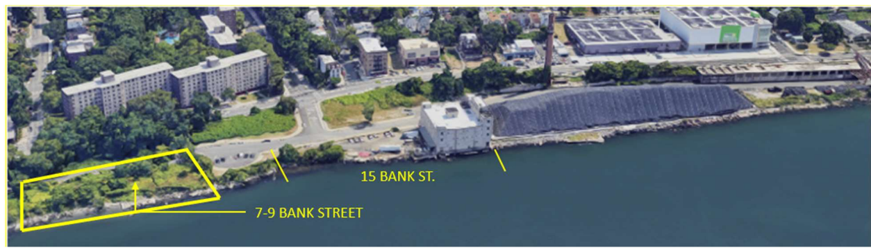
Figure 3: Looking south. 7-9 Bank Street is a potential cargo laydown area that might play a role in the "support vessel port" described on page 7 below. 15 Bank Street, owned by Atlantic's subsidiary, is a prospective "maritime hub" as shown in Figure 7.

• Currently in the planning stage, the repair of the shoreline from the 15 Bank Street building westward toward the middle of the terminal.