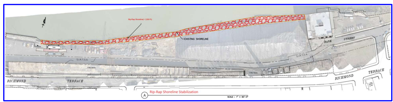
Figure 5: This plan has been developed to repair the eastern half of the Atlantic shoreline to preserve terminal space and to resist the erosion caused by strong tidal forces and heavy ship and tugboat traffic in the Kill Van Kull.

As the DEIS correctly notes, "larger vessels passing through the Kill Van Kull as a result of the Bayonne Bridge modification are anticipated to further exacerbate erosion. At present, the right-of-way and bulkhead in the vicinity of Sailors' Snug Harbor has sustained substantial storm damage and has largely been submerged by the Kill Van Kull." <u>See</u> DEIS at 459. Although not mentioned in the DEIS, plans are already afoot to deepen the navigation channel in the Kill Van Kull another five feet. This is likely to result in widening of the navigation channel and an increase in traffic by mega-container ships. The forces of erosion on the North Shore are likely to grow. <u>See</u> New York and New Jersey Harbor Deepening Channel Improvements Navigation Study Final Integrated Feasibility Report and Environmental Assessment, United States Army Corps of Engineers, New York District (April 2022) available at