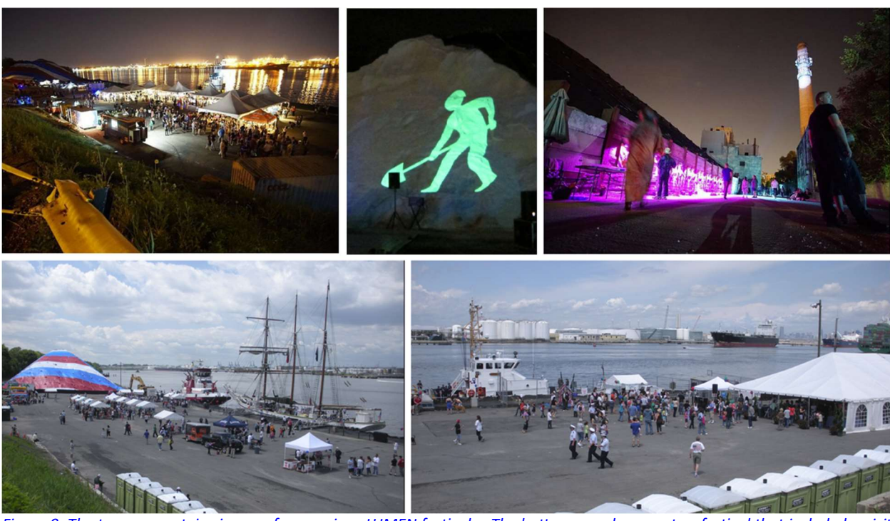
Figure 9: The top row contains images from various LUMEN festivals. The bottom row documents a festival that included a visit from an FDNY fire boat, a Coast Guard cutter, and another tall ship.

In August 2009 Atlantic hosted the replica of Henry Hudson's vessel Half\ Moon . The festival was open to the public. As reported in The\ Staten\ Island\ Advance , "The family fare—all of it free—includes tours of both vessels, food, beverages 17th-century games, and kiddie rides, music, dance performances, sprinklers." (August 29, 2009). Preceding the festival, the company hosted a dinner on the wharf for the Staten Island Chamber of Commerce. Mayor Bloomberg made an appearance and spoke to the gathering. In addition to vessels like the Half\ Moon , Atlantic has also hosted visits from other tall ships, including the U.S. Coast Guard's training vessel Eagle in 2015.