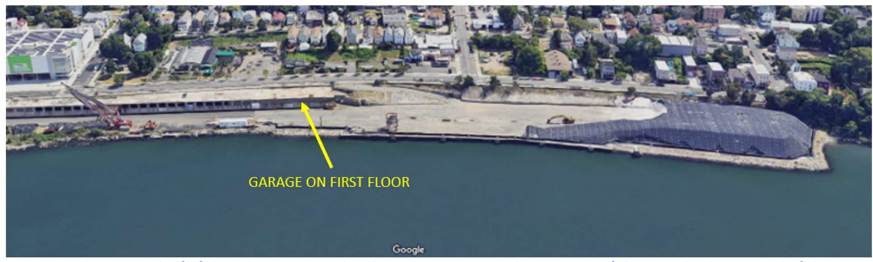
Figure 4: The western half of the Atlantic terminal. The garage occupies a long section of the tunnel. The removal of the upper stories of the 840-foot-long building removed some hazards while creating an opportunity for views from a BRT at street level.