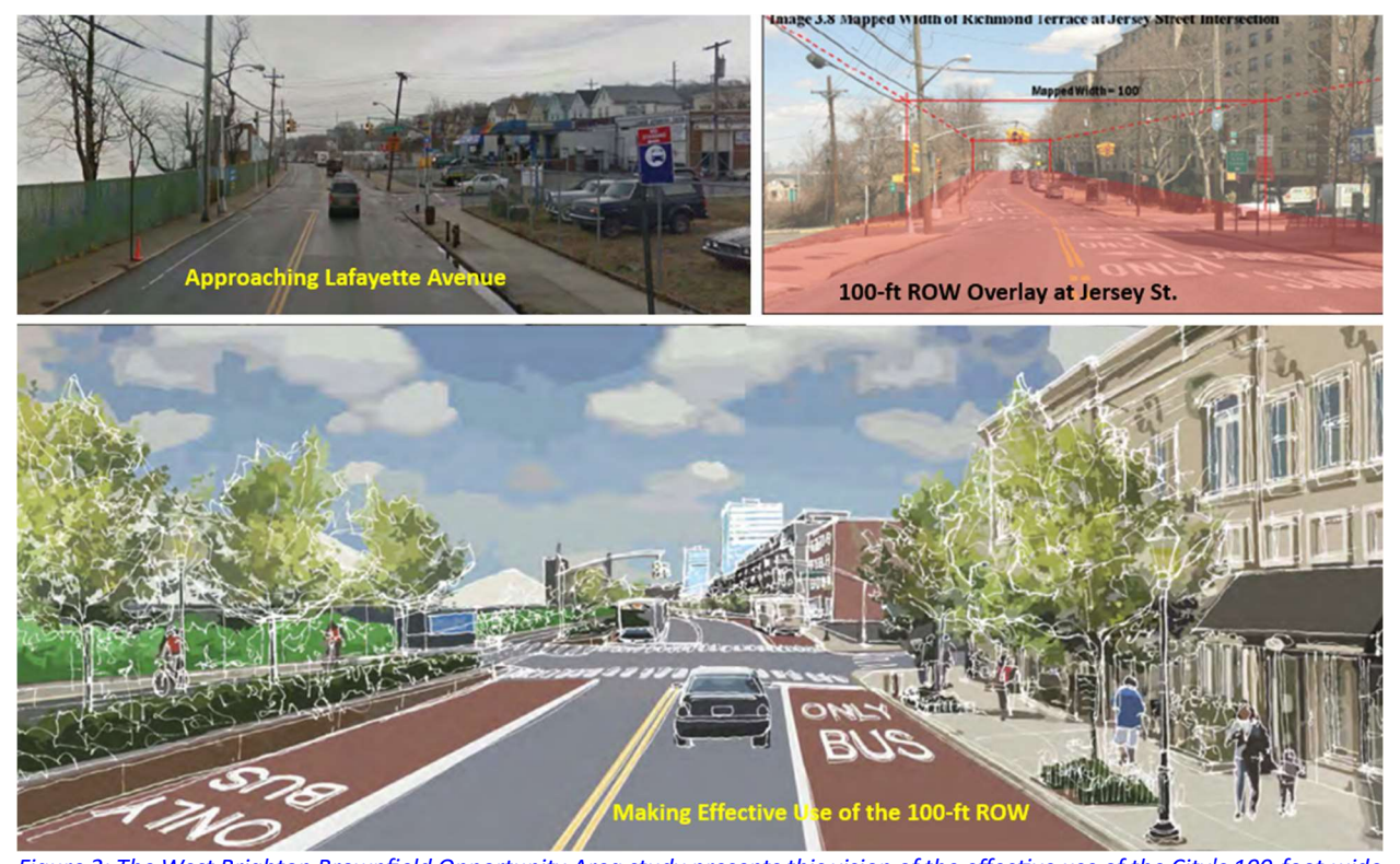
Figure 2: The West Brighton Brownfield Opportunity Area study presents this vision of the effective use of the City's 100-foot-wide Richmond Terrace right of way. See Image 4.3 on page 118 of the study.

<u>Id</u>. at 113-114. Figure 2 below paints that vision. These pictures are drawn from Image 4.3 and other sources in the <u>West Brighton Brownfield Opportunity Area</u> study. Instead of leveraging a valuable resource that the city has owned for 60 years—the 100-foot-wide Richmond Terrace ROW—the DEIS removes the BRT from the neighborhood's street life and hides the BRT in a tunnel that is badly needed to support an ongoing maritime operation. Building the BRT in the existing 100-foot-wide Richmond Terrace ROW will create an active link between BRT riders and the New Brighton neighborhood and probably—by increased visibility—increase ridership from the neighborhood itself. Using the city's existing 100-foot-wide resource will also give riders a view of the active working waterfront in fulfillment of <u>WRP</u> Policy 8. <u>See</u> in particular Policy 8.3 ("Provide visual access to the waterfront where physically practical.")