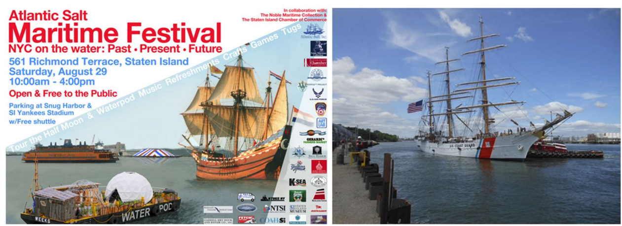
Figure 8: On the left is the poster for the 2009 festival when Atlantic hosted the replica of Henry Hudson's Half Moon. In 2015, Atlantic hosted the visit of the Coast Guard's tall ship Eagle.

In August 2009 Atlantic hosted the replica of Henry Hudson's vessel Half\ Moon . The festival was open to the public. As reported in The\ Staten\ Island\ Advance , "The family fare—all of it free—includes tours of both vessels, food, beverages 17th-century games, and kiddie rides, music, dance performances, sprinklers." (August 29, 2009). Preceding the festival, the company hosted a dinner on the wharf for the Staten Island Chamber of Commerce. Mayor Bloomberg made an appearance and spoke to the gathering. In addition to vessels like the Half\ Moon , Atlantic has also hosted visits from other tall ships, including the U.S. Coast Guard's training vessel Eagle in 2015.