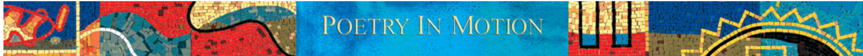
Mosaic artwork from 149th Street subway station by José Ortega for MTA Arts for Transit