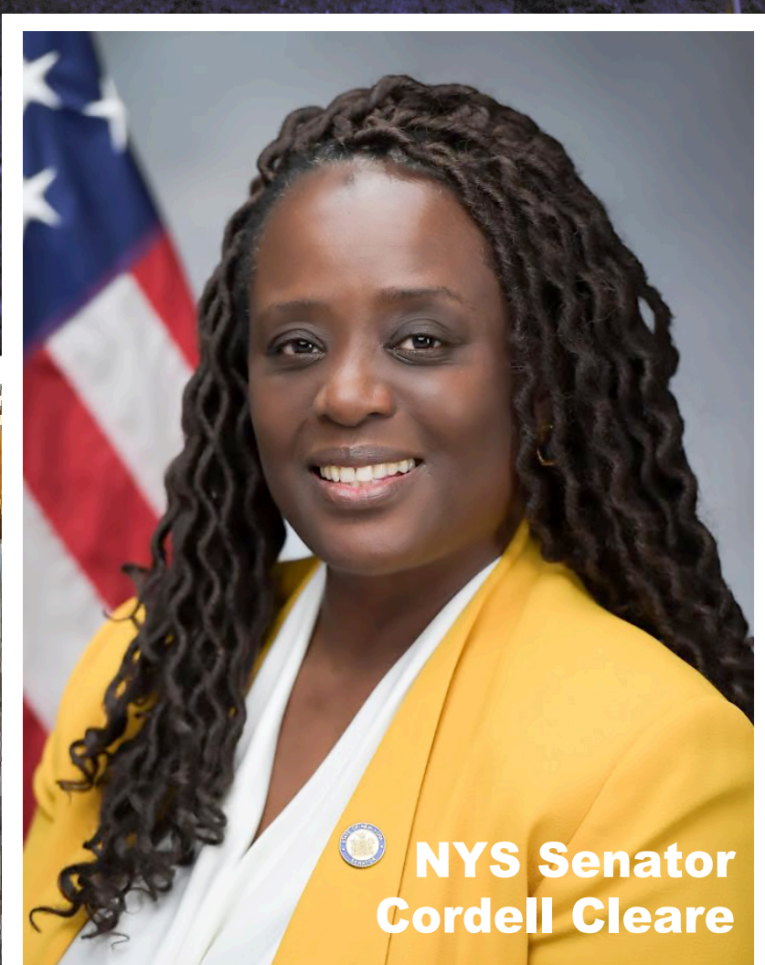
NYS Senator Cordell Cleare