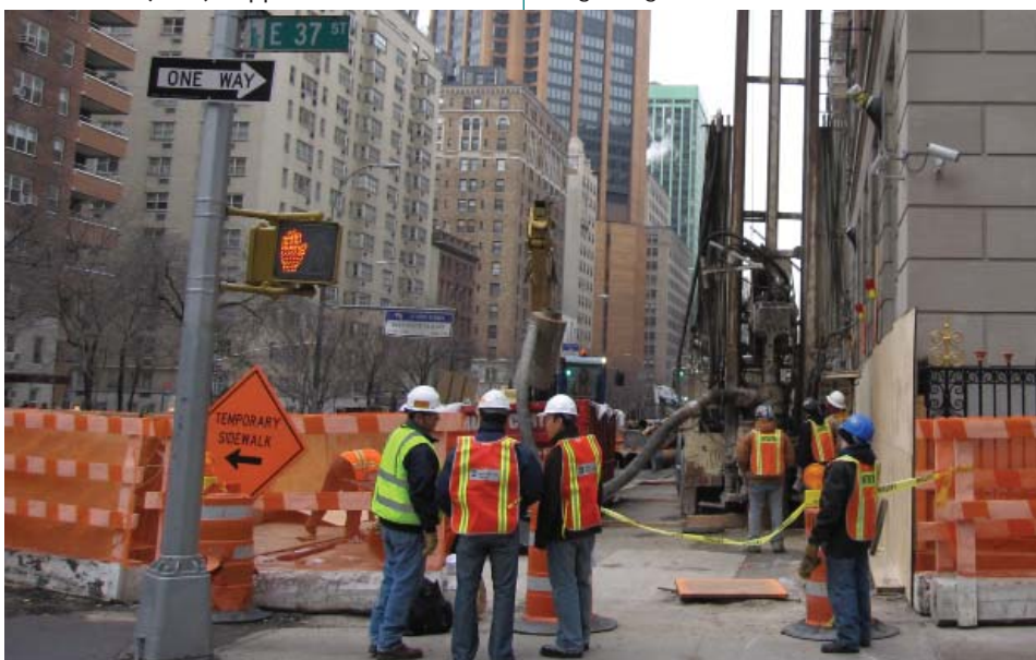
Drilling holes for support of excavation (now completed).

At times, it will be necessary for the contractor to occupy the parking lane and one traffic lane on Park Avenue between 36th and 37th Streets as well as the intersection of Park Avenue and 37th Street. Pedestrian access along sidewalks will be via a 5-foot wide walkway. Access to building entrances will be maintained at all times.