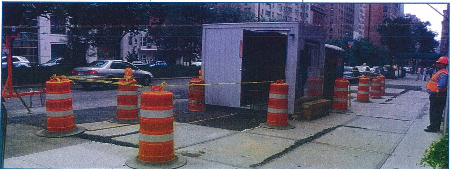
Work site after demobilization.

At times, it will be necessary for the contractor to occupy the parking lane on the south bound Park Avenue lane between 36th and 38th Streets. Pedestrian access along sidewalks will be maintained. Access to building entrances will also be maintained.